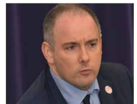
Robert Halfon, MP, chaired the session