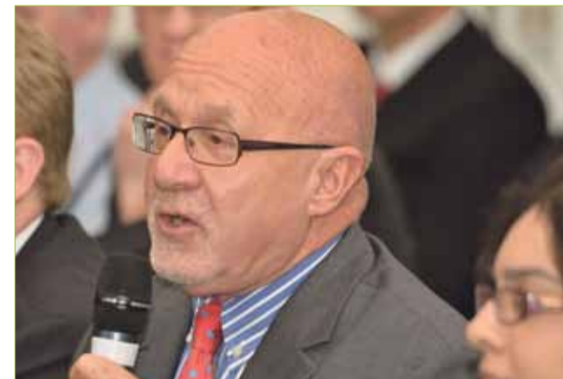
Attendees were given plenty of time to contribute their own views and ask the speakers challenging questions