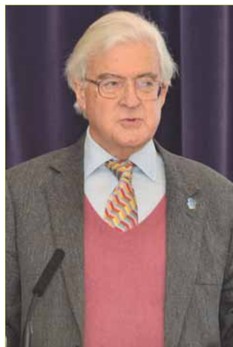
Lord Baker, Baker Dearing Educational Trust

"Quite a high percentage of our youngsters