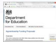
Aug - Sept 2016