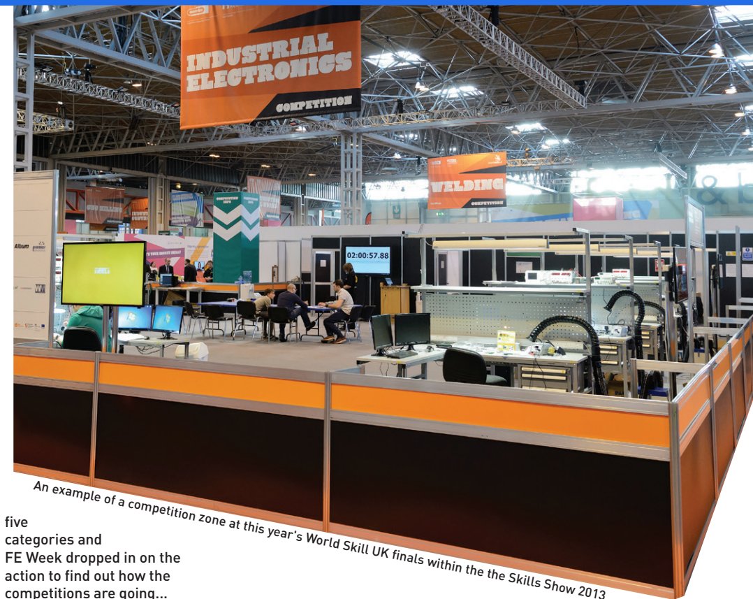
An example of a competition zone at this year's World Skill UK finals within the the Skills Show 2013.