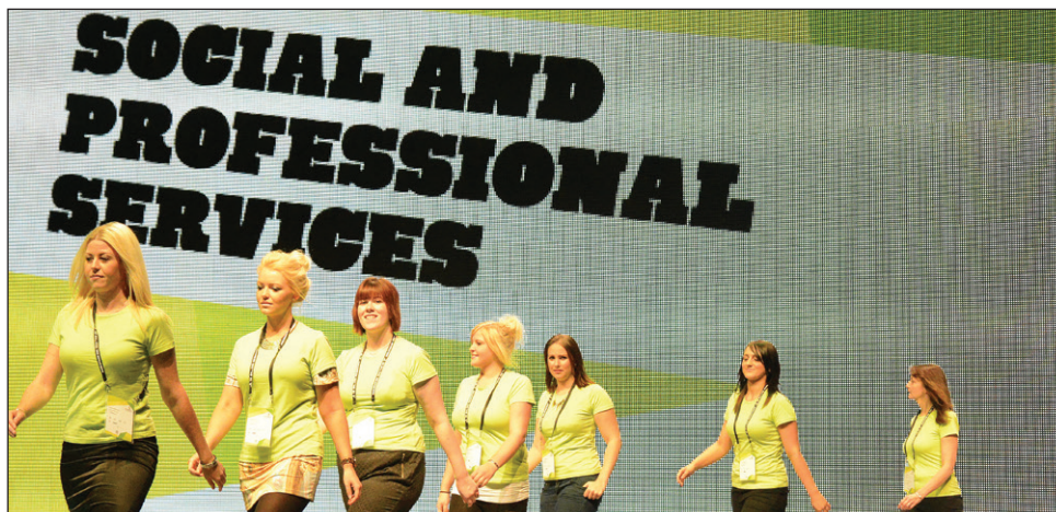
Competitors walk on stage during the opening ceremony.