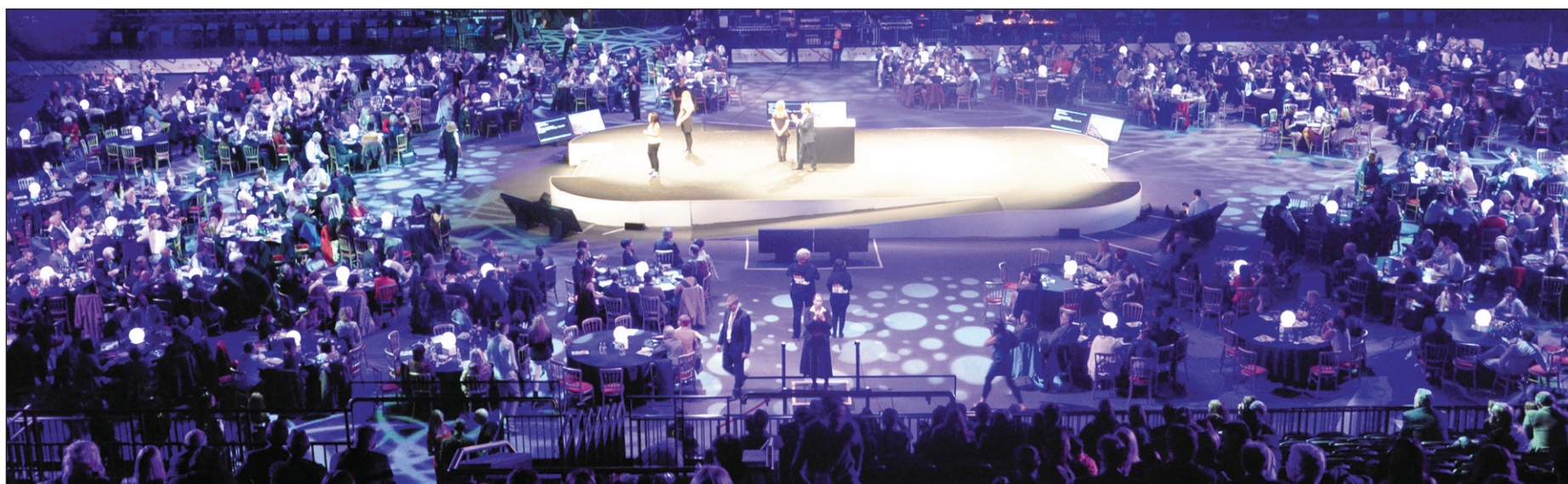
The opening and closing ceremony was held at the LG Arena in Birmingham

"We really want to see more people entering competitions to prove to the whole of the UK just how many talented people we have in this country"