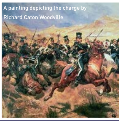
A painting depicting the charge by Richard Caton Woodville