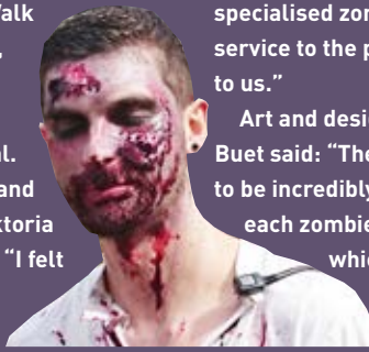
A charity walker made-up like a zombie

each zombie their own identity, which is something all professional artists need to be experts at."