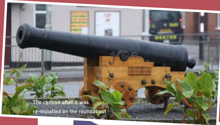
The cannon after it was re-installed on the roundabout