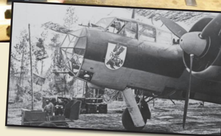
A Dornier 17 ready to take-off during the second world war