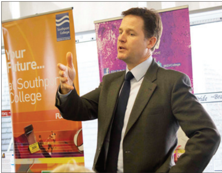
Nick Clegg talking to students from King George V College and Southport College