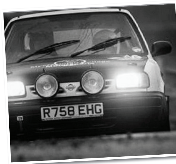
The college's Nissan Micra during the rally

Myerscough College staff and motorsport students hit top gear by rebuilding, servicing and racing in cars for a rally.