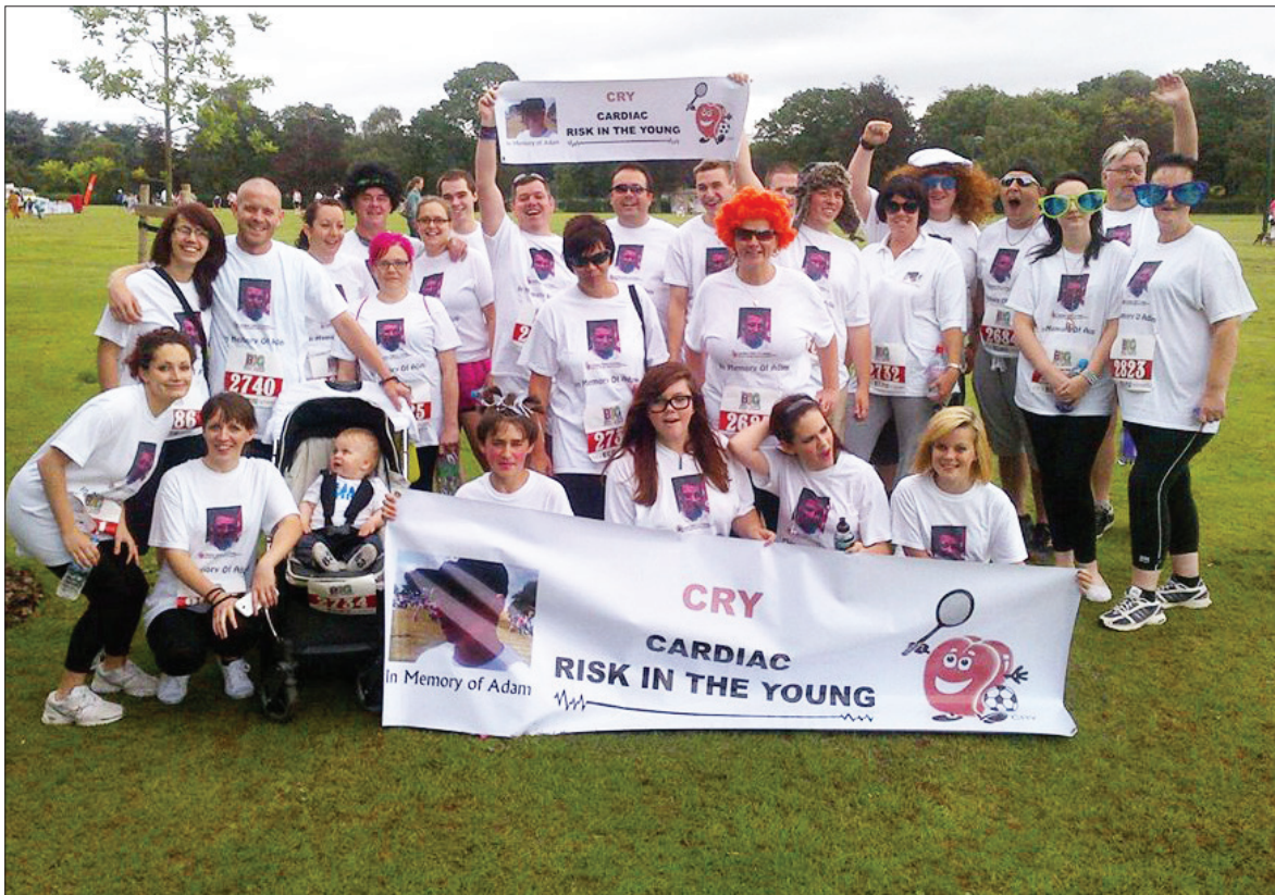
Fundraisers taking part in a fun run in Coventry Memorial Gardens