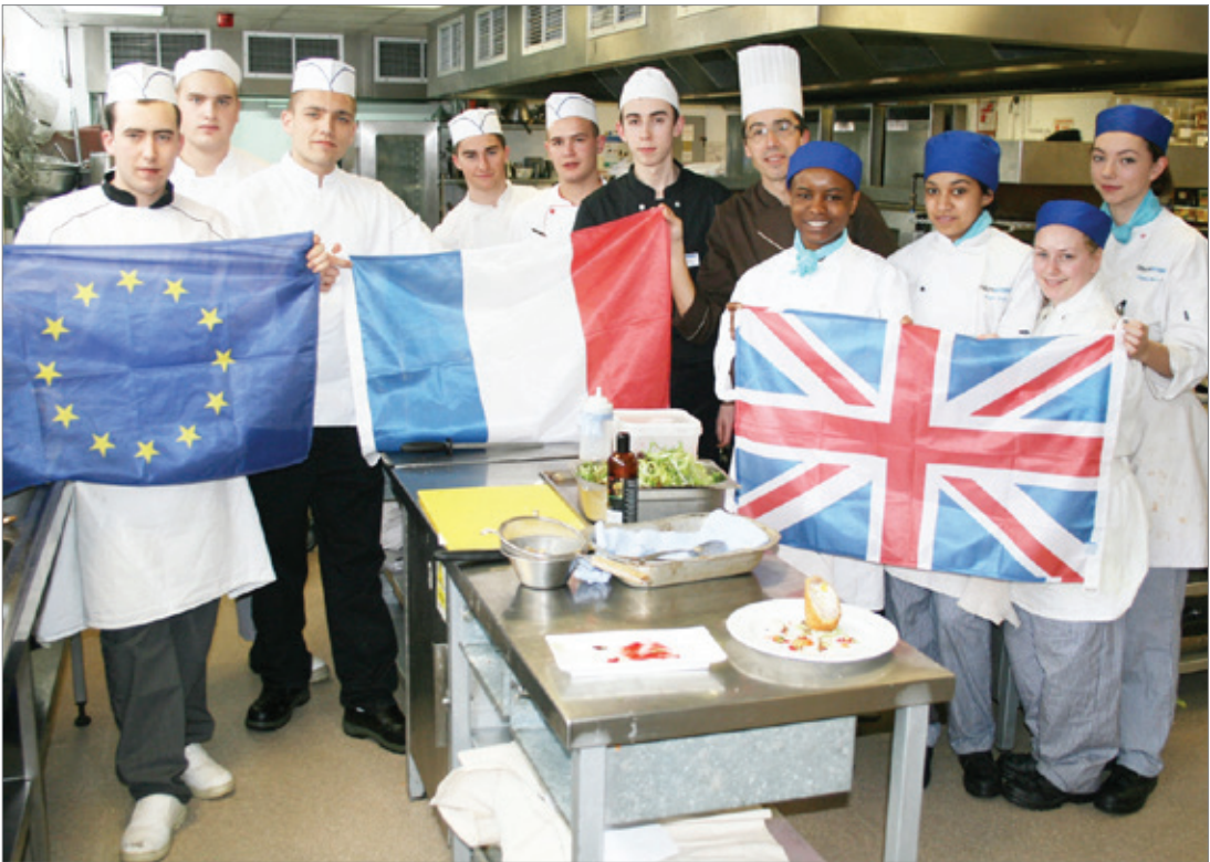
English and French students in City College Brighton and Hove's training kitchen holding the British, French and European Union flags