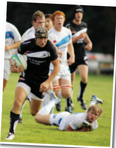
Jack Nowell playing for Truro College against Ivybridge College in 2009

The 20-year-old made his Six Nations debut in the heart-breaking 26-24 defeat to France at the Stade de France two weeks ago.