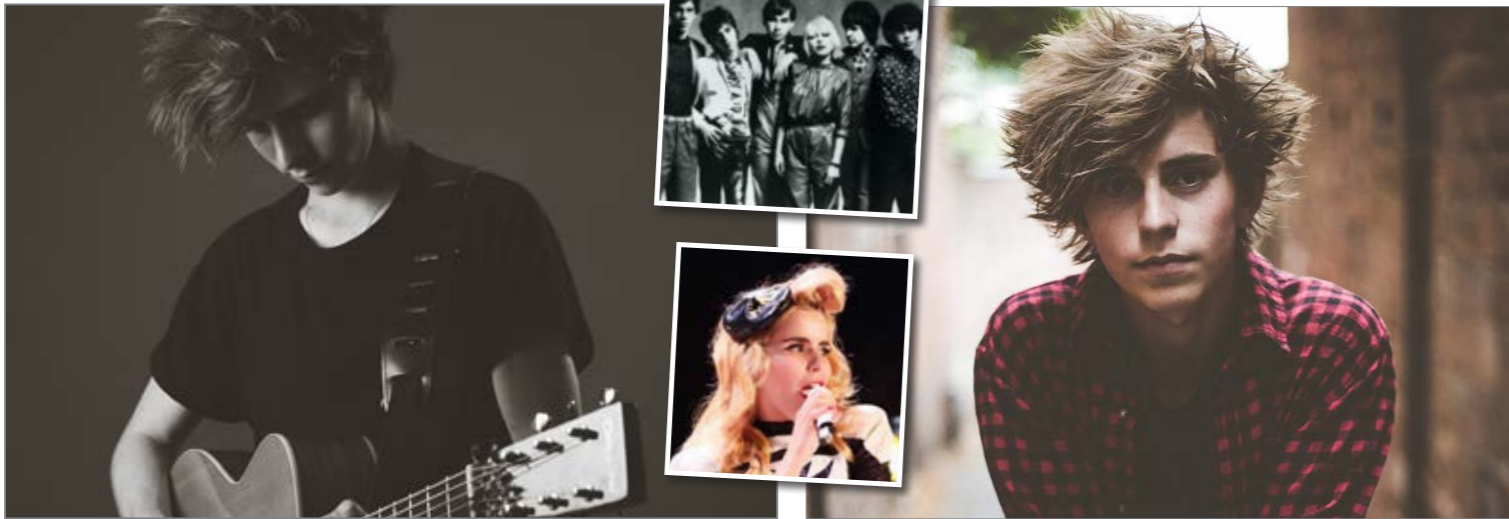
Joe Dolman. Inset top: Blondie at the peak of their fame in 1979. Inset below: Paloma Faith