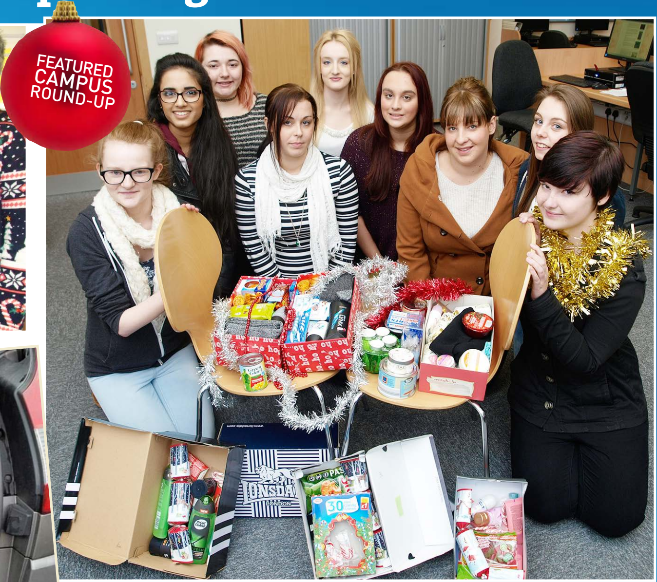
Above: GCSE learners with some gift boxes. Below: Army cadets and supervisors with the boxes