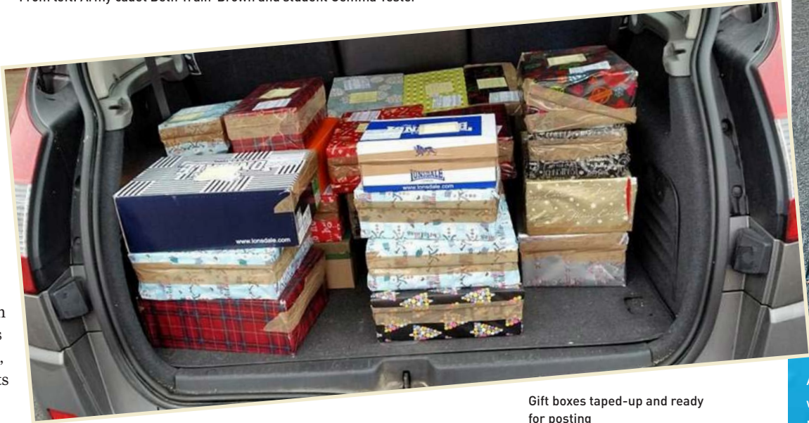
Gift boxes taped-up and ready for posting